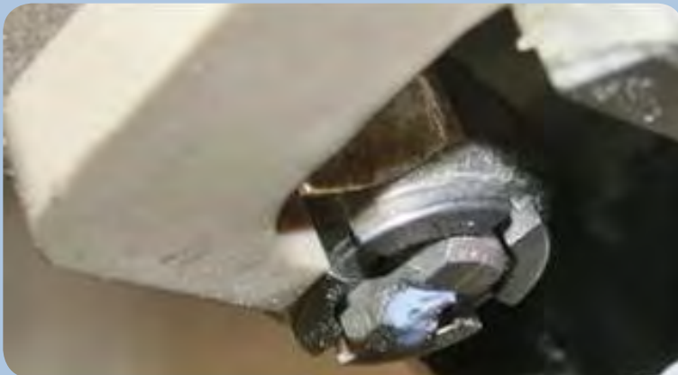
Nozzle after breakdown

Although water-based lacquers are becoming increasingly commonplace in outside seam applications, they have a downside: lateral build-up of lacquer as a result of the drop in pressure after they leave the nozzle. This build-up can have a negative impact on the lacquer jet. Today, the nozzle has to be cleaned periodically by hand.